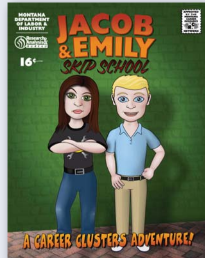
*1st draft cover design

Montana Career Resource Network - P.O. Box 1728 - Helena MT 59624-1728 Phone: (406) 444-3239 or Toll-free: (800) 541-3904 - www.ourfactsyourfuture.org